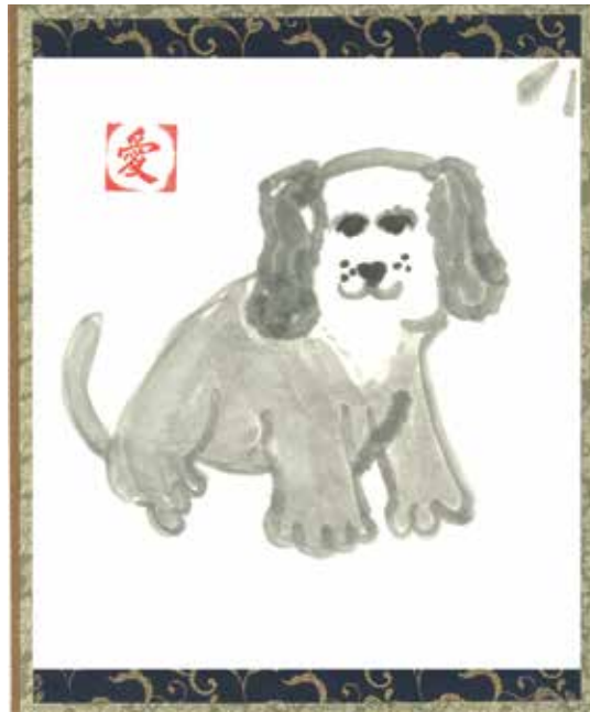
Veronica from 7-11 year old class

The young painters in these classes learn many of the procedures of Japanese ink painting and calligraphy and improvise on natural and imaginative themes, the finished work expresses their joy of and focus on painting. Their paintings are shown in regular exhibitions.